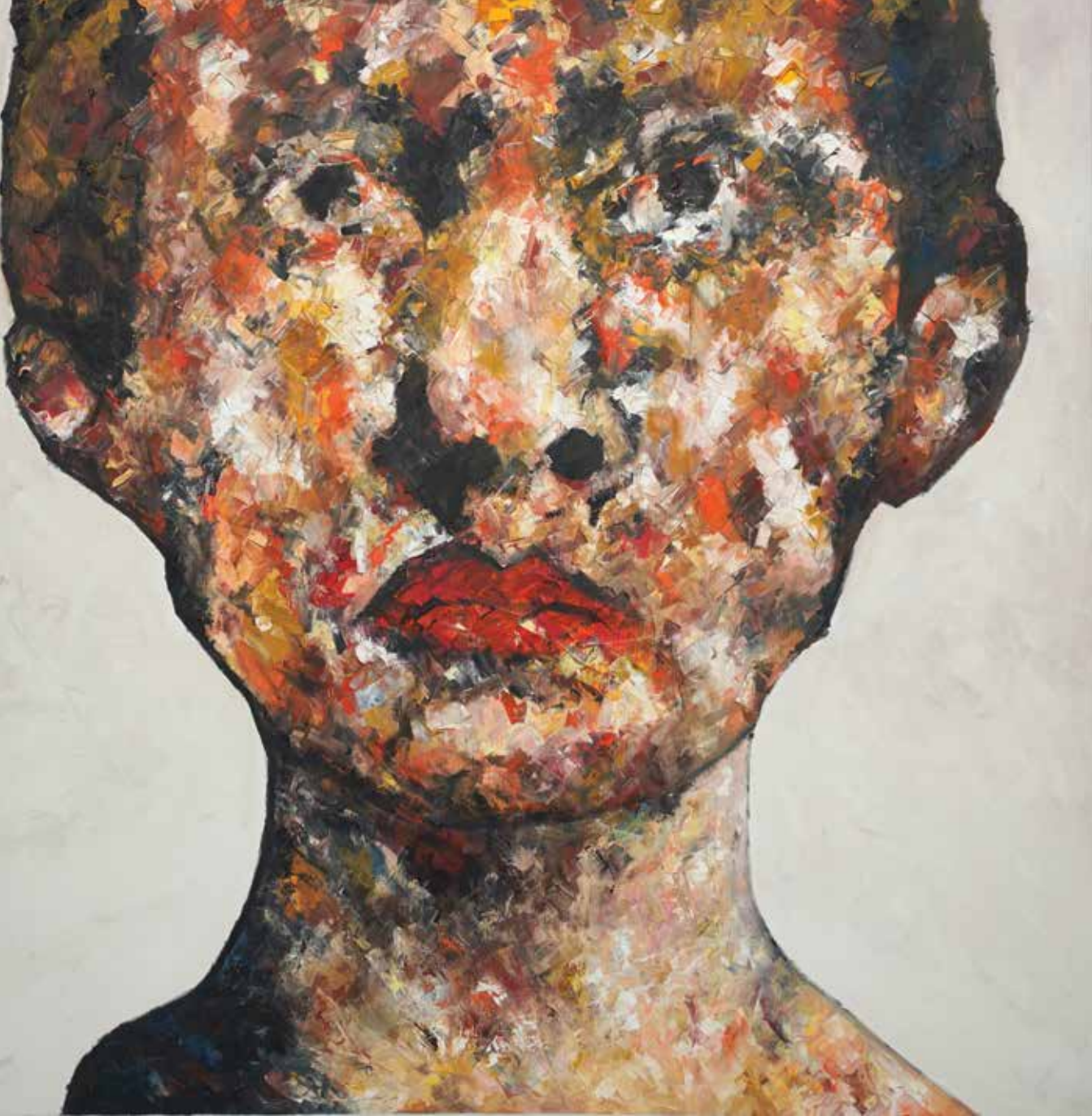
Post-Contemporary Painterly Mosaic (2019) oil on canvas 150x150