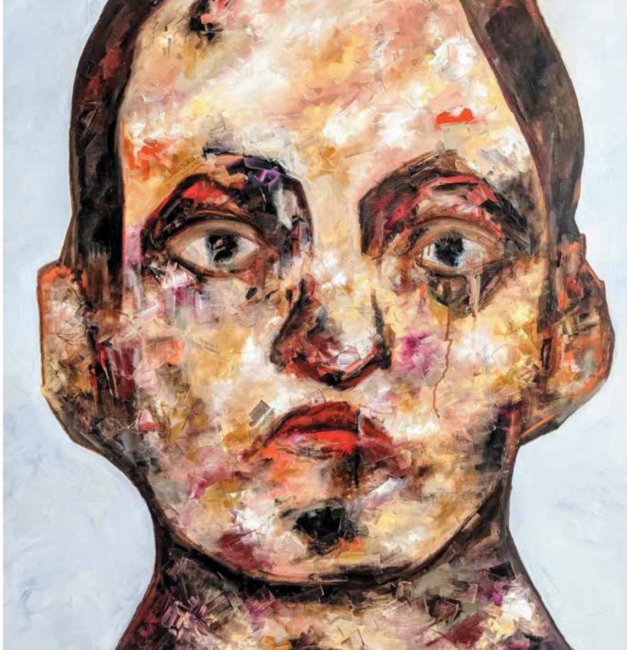
Count of Monte Cristo (2019) oil on canvas 120x120