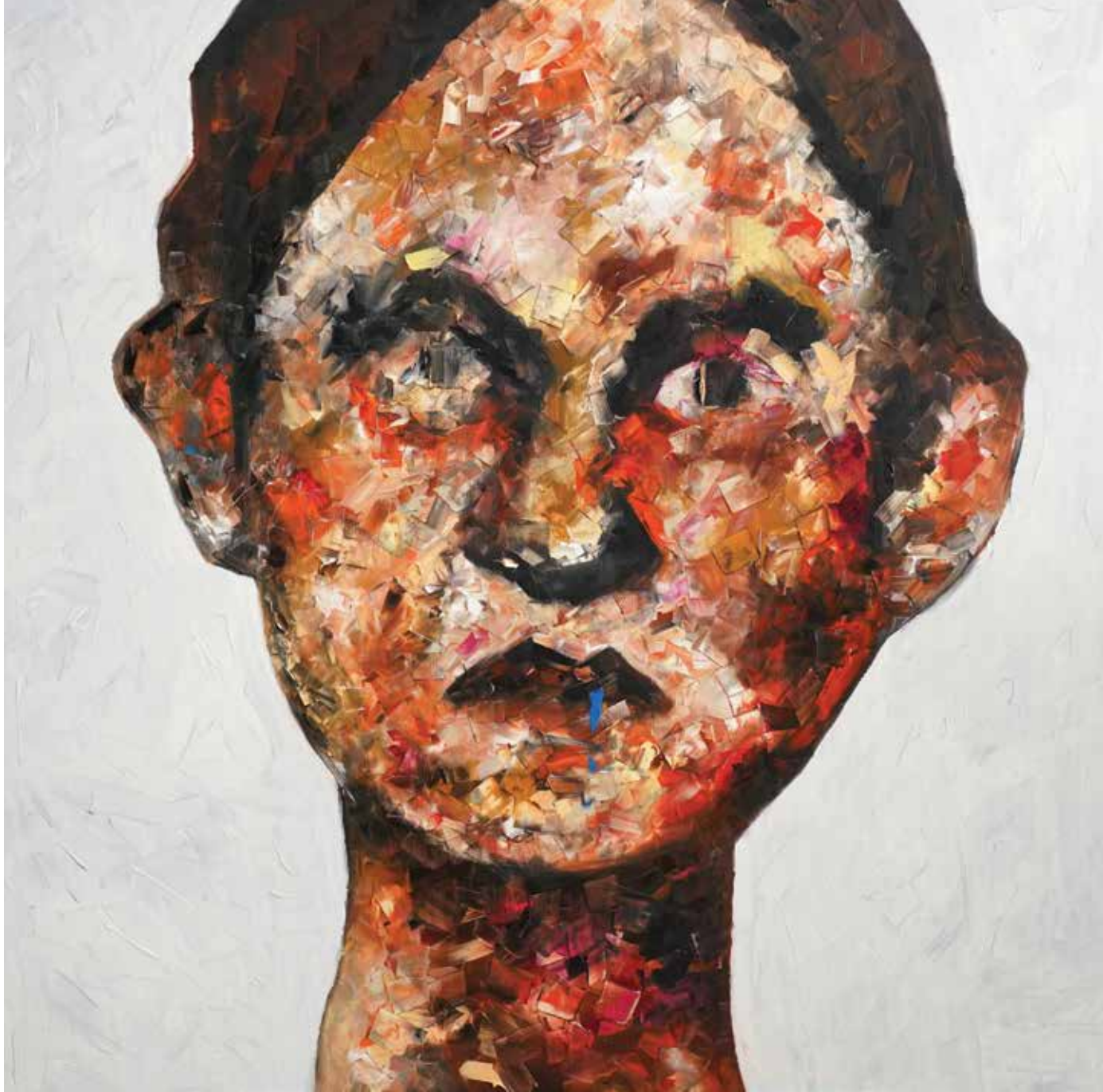
Face of June (2019) oil on canvas 100x100