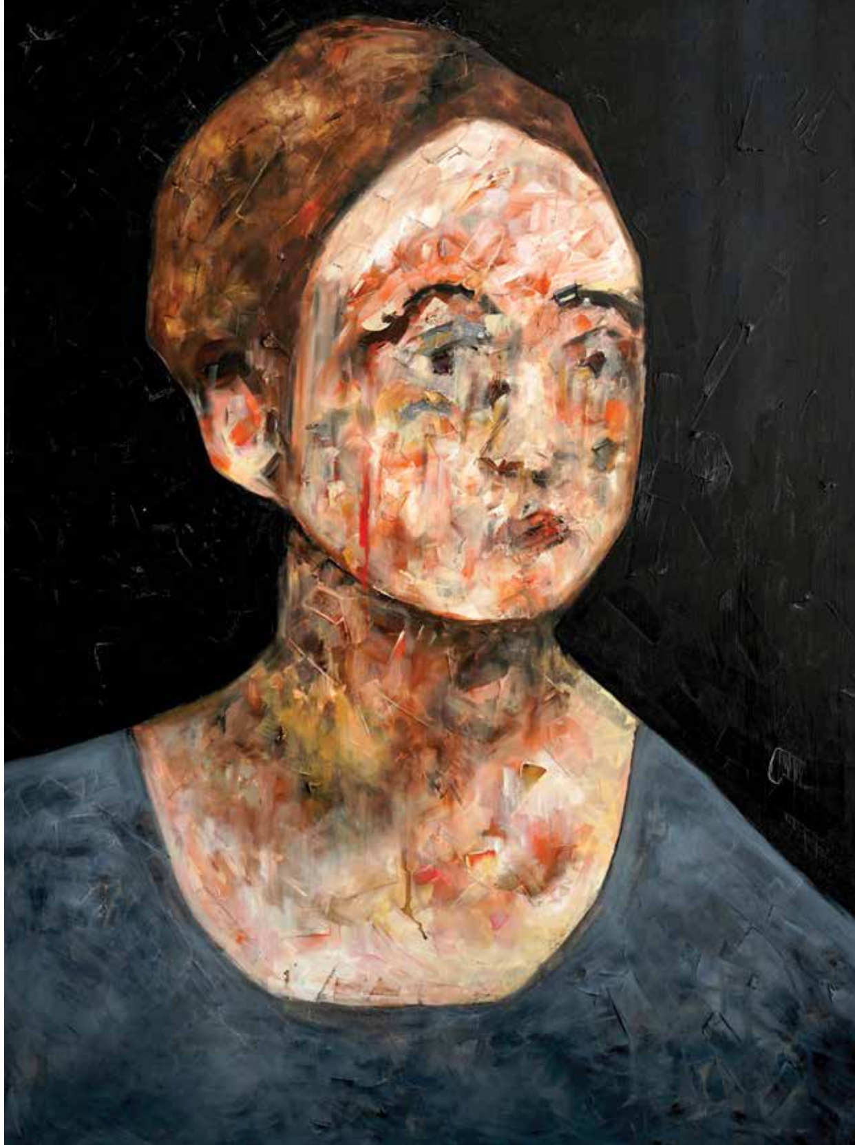
Seeking a Room of One's Own (2019) oil on canvas 120x90