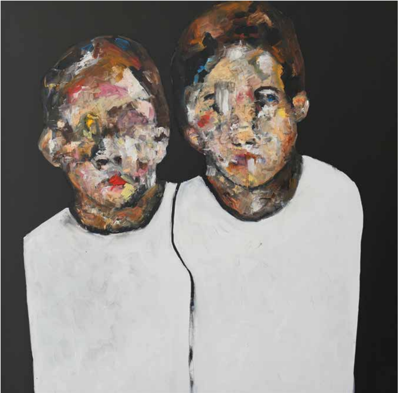
Two Kids Sitting Next to Each Other (2019) oil on canvas 80x80