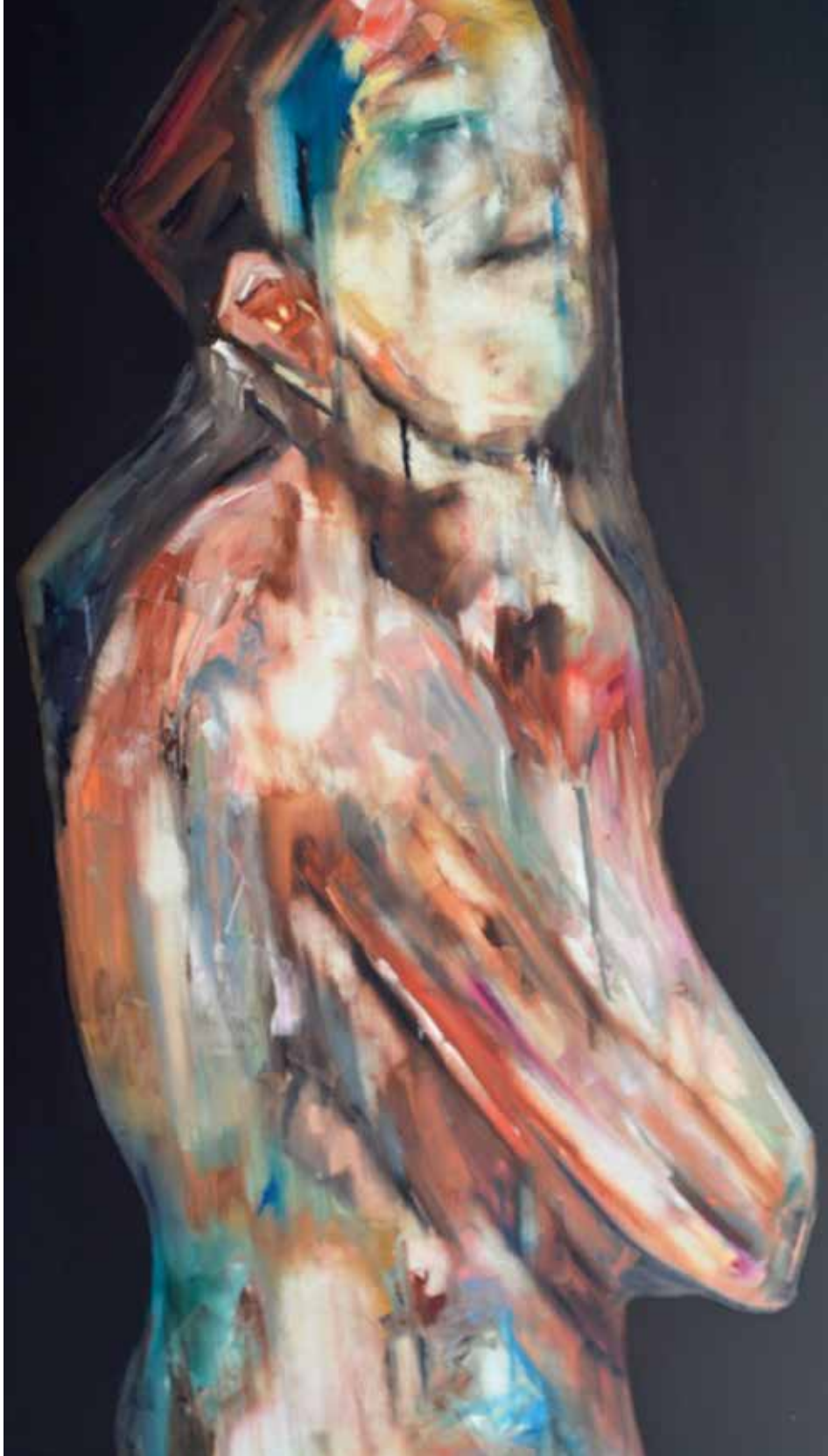
Trapped in the Amber of the Moment (2019) oil on canvas 100x70