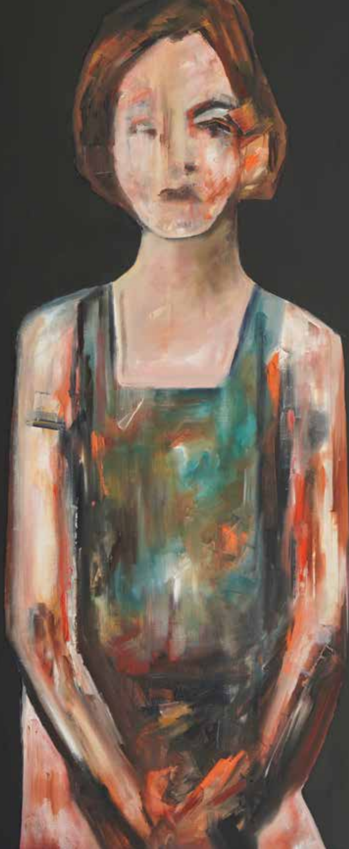
Being Idle (2019) oil on canvas 90x60