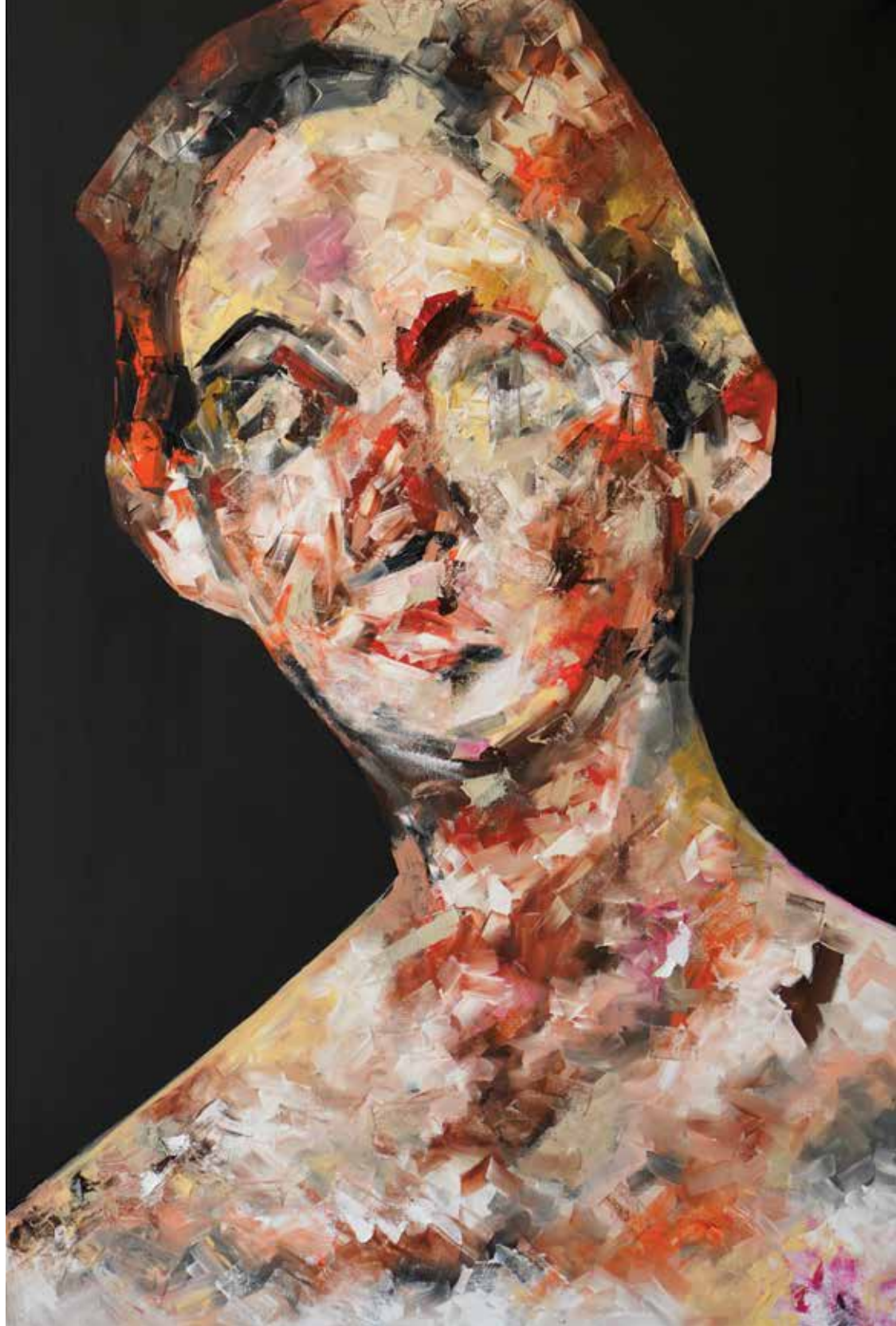
Standing Still Somewhere Unknown (2019) oil on canvas 120x80