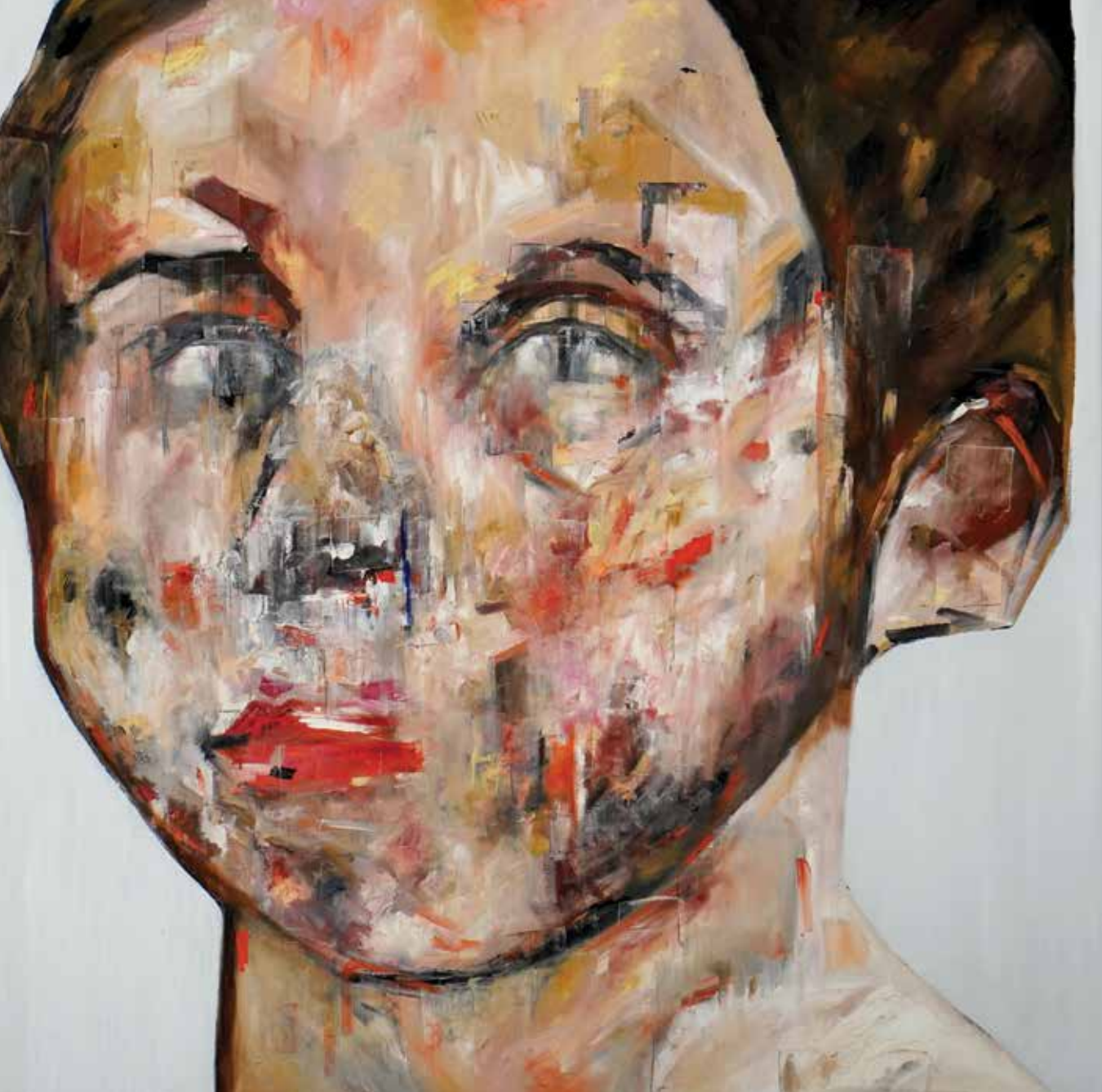
Portrait of a Child (2019) oil on canvas 100x100