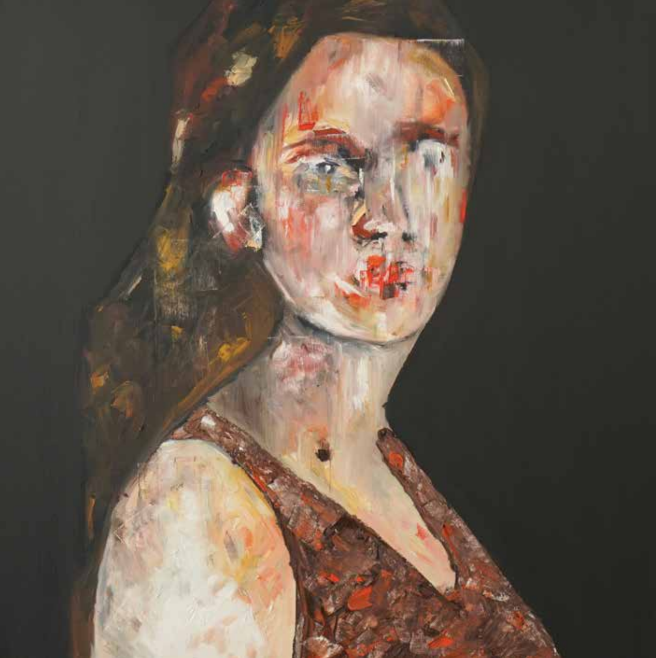
Portrait of a Woman I (2019) oil on canvas 60x60