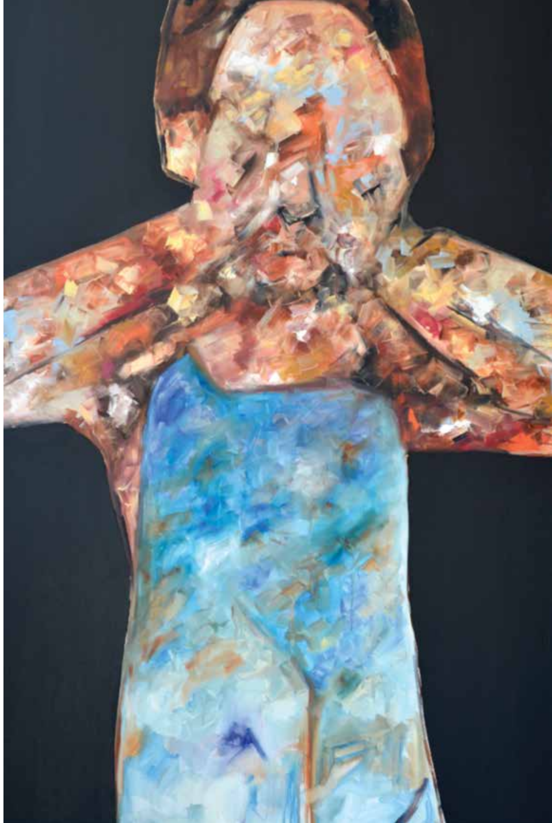
How to Break Free from Overthinking (2019) oil on canvas 150x100