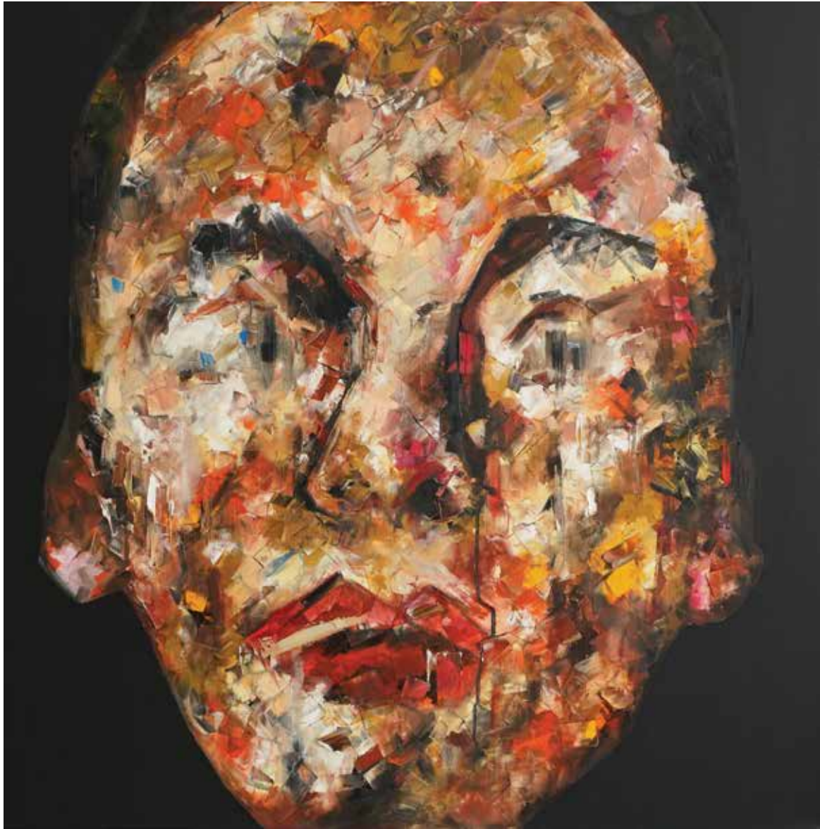
Looking Through the Glass (2019) oil on canvas 100x100